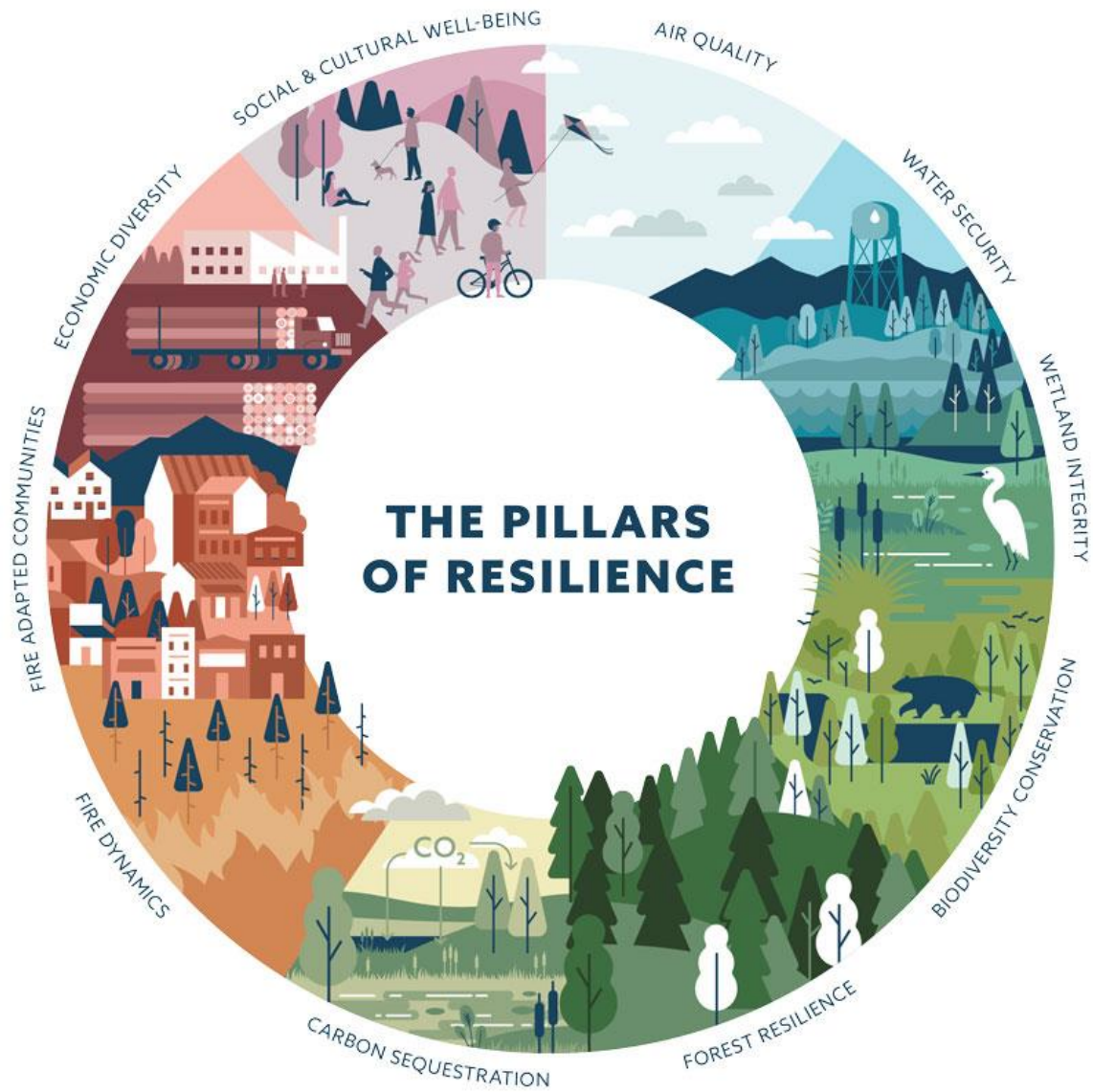
Figure 2 Pillars of Resilience