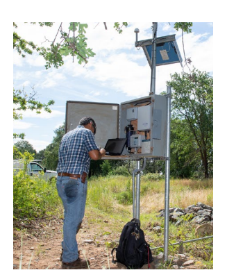
Above: A water resources technician with California Department of Water Resources, works at the station house of the newly installed North Honcut Stream Gage on Honcut Creek in Butte County, California.