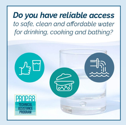
Above: A screenshot of a social media graphic developed to engage underrepresented communities.