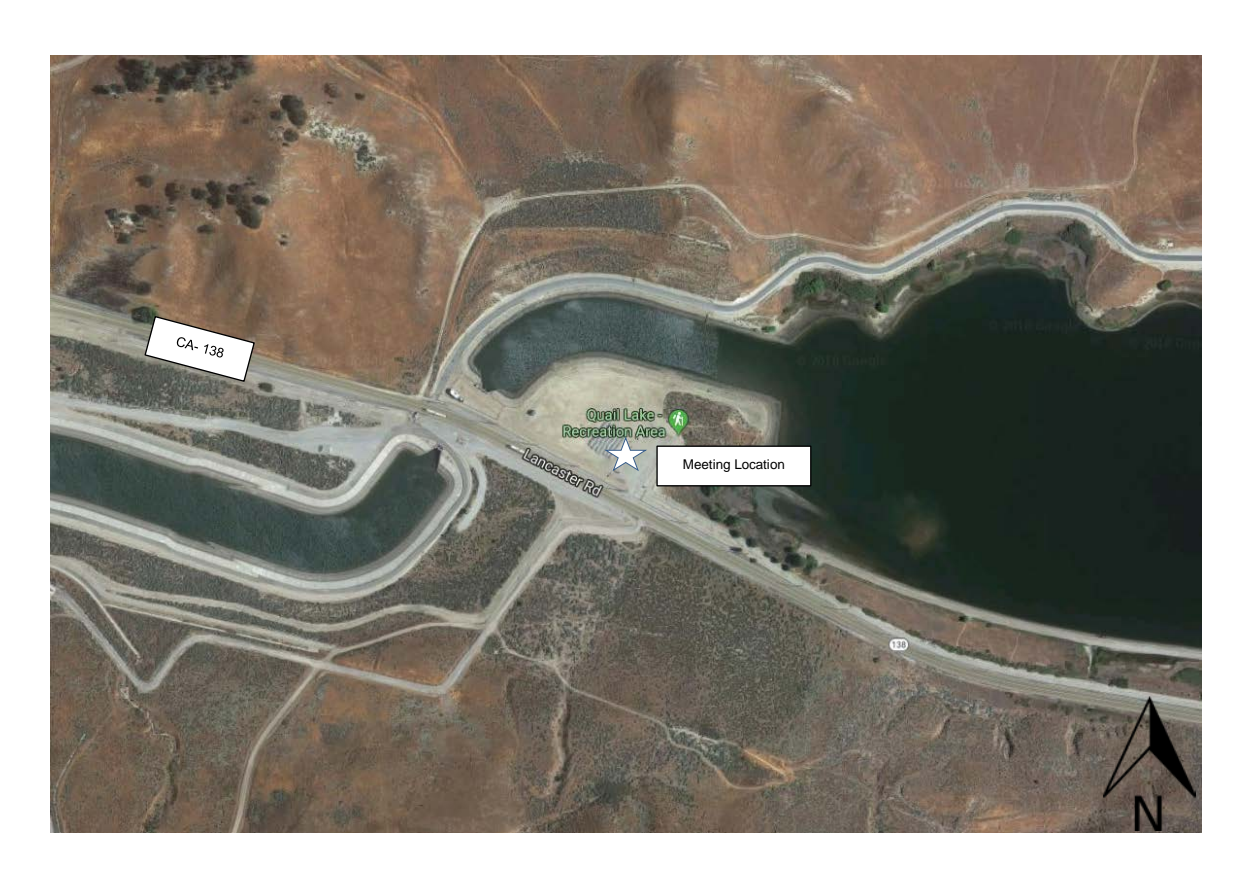
Area Map Meeting Location