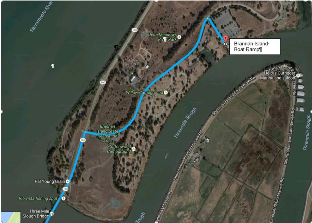
Brannan Island boat ramp