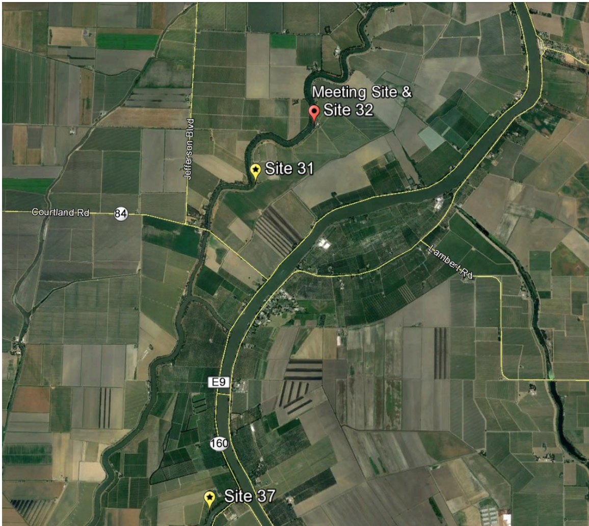
LOCATION OF PROJECT SITES MAP