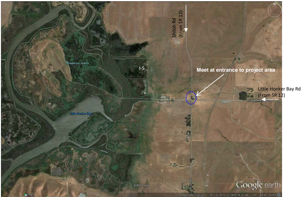
Meeting Area Map