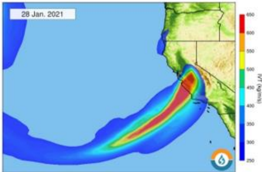
Figure 2 Path of Only Major Atmospheric River to make California Landfall in 2021

A WCM update that includes consideration of FIRO can give reservoir operators updated forecasting information to optimize how the reservoir can be operated with current weather forecasting skill. More accurate predictions of incoming weather events, especially atmospheric river storms – the leading cause of floods in California – can mitigate flood risk by releasing water in advance of a storm or, conversely, mitigating drought impacts by holding water back when no storms are in sight. FIRO