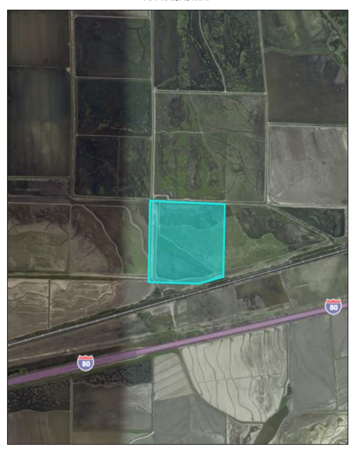
A plat map was not provided for review. Based on the acreage reported in the draft easement language, an exhibit was created using Landvision commercial data to illiterate the impacted area.