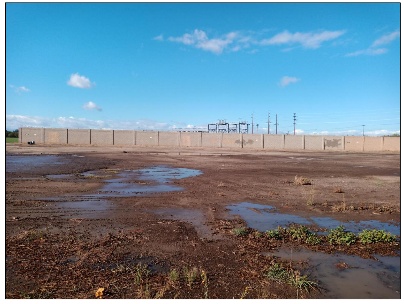
Figure 3. Overview of Proposed Generator Installation Area. View to the east.